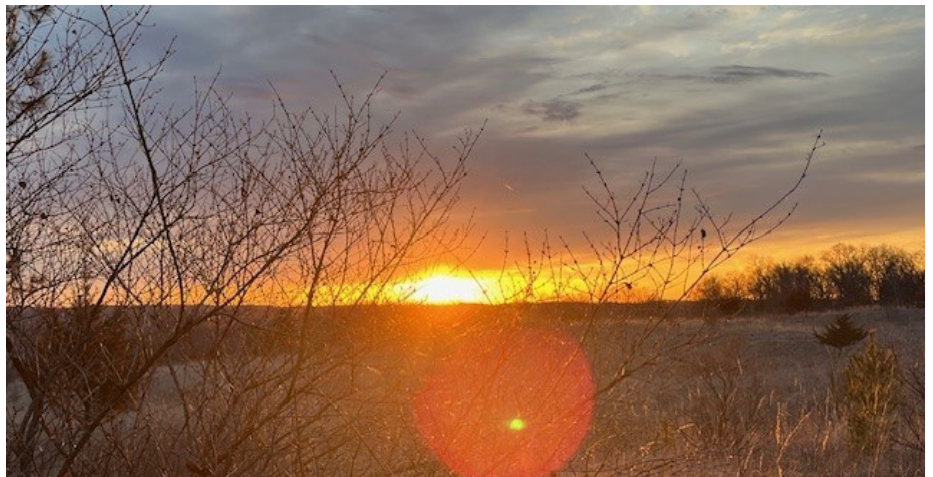
Sunrise at William O'Brien State Park, March 13, 2024.